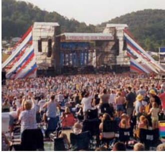
Creation Festival attendees become Members of The League at our "Pocket Power" booth.