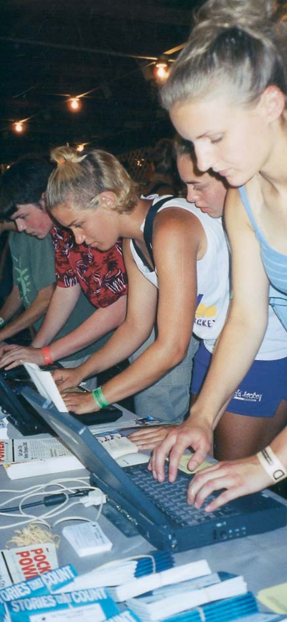
Young people using laptop computers to become Members of The League at the Creation Festival "Pocket Power" booth.