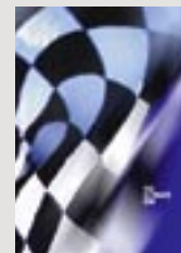
"The Ultimate Win" was designed for motorsports.