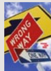
"Finding Your Way" NIV presents life's choices.