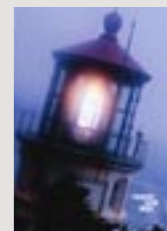
"Finding Your Way" KJV has a new look.